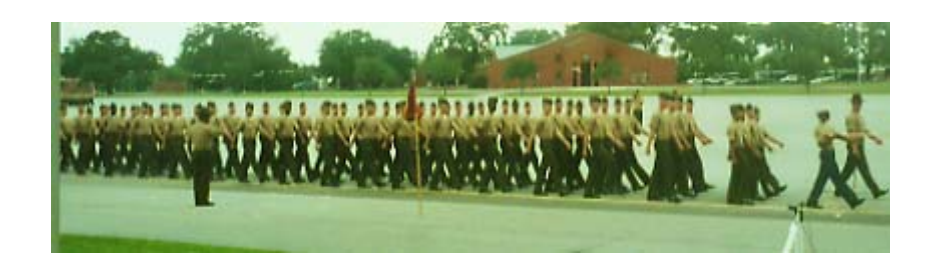
Platoons 2080, 2081, 2082, 2084, 2085, 2086, all Male Marines

The band began with a stirring musical medley by the Depot Marching Band, followed by the eight platoons and the Color Guard marching across the parade field and all passing in front of the reviewing stand and their families and friends seated in the bleachers as well. Following the six male platoons passing in review came the Depot Color Guard, and then the two platoons of Women Marines finished the March. (The Marine Corps is still the only military service training their recruits separately by gender).