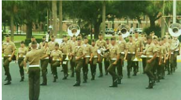
Color Guard and Marine Marching Band, Marine Corps Recruit Depot, Parris Island, S. C. at Morning Colors, 17 September 2004