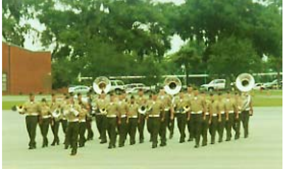
Eight Graduating Platoons of Marines muster at end of parade field as the Depot Band assembles

When the command was given eight massed platoons of fit, disciplined and smart Marines marched in platoon formation in front of the reviewing stand and assembled guests seated in the bleachers.