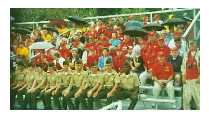
E-2-5 Marines in Reviewing Stand

But what a thrill it was witnessing these 500 new Marines earning that title and their Eagle, Globe and Anchor at the same time. I would estimate there were between one and two thousand visitors in attendance the day of our visit, consisting of family members and friends of the over 500 graduating recruits. Various introductions were made to the assembled guests, each accompanied by substantial applause.