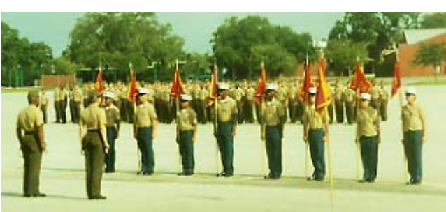
DI's and Honor Graduates come "front and center" for recognition

Just prior to passing in review the Honor Graduates were also called "front and center" to be recognized and presented with plaques by both their own DI and the Lieutenant Colonel in charge of training at Parris Island. Each of the Honor Graduates was also wearing their new Private First Class (PFC) chevrons earned as part of their honors. (Noting this, it reminded me that to this day I never understood why my junior DI was "only" a Private, the same rank as his recruits)?