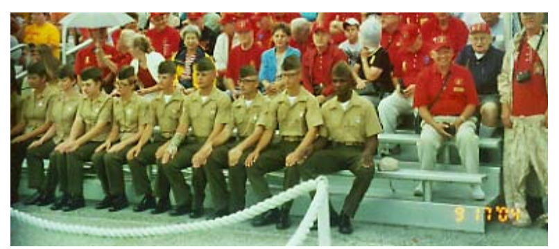
Nine Marine Privates in reviewing stands (Writer is seated to right of lady in the blue jacket)

As luck would have it, I was seated in the second row from the bottom, closest to the official reviewing area. Upon sitting down I could not help but notice there were nine Marine privates, four female and five male, seated in the first row immediately in front of me. Simultaneously I noticed that immediately behind them, a half step below my feet, were neatly stacked rows of crutches. I thought that strange but did not dwell on it.