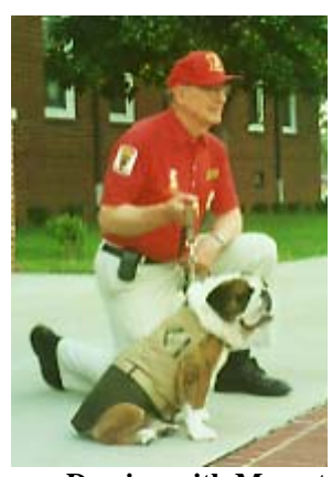
E-2-5 (Korea) Association at 16Sep04 Reunion, MCRD PI SC