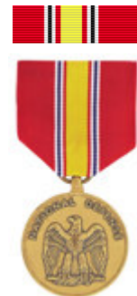
NATIONAL DEFENSE SERVICE MEDAL