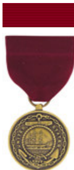
GOOD CONDUCT MEDAL SECOND AWARD