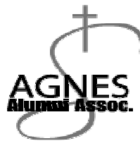
St. Agnes A.A., Sparkill, NY