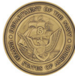
SEAL OF THE UNITED STATES NAVY