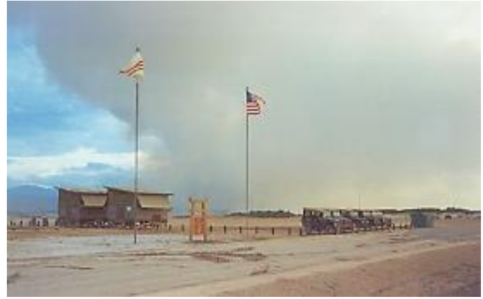
3 rd Marine Division Headquarters before and during dust storm, Phu Bai, Vietnam 1967

I was regularly assigned as a leader of one of the several Provisional Platoons around our Command Post (CP) perimeter at night with a force that was responsible for assuring the command's security for my sector. I also went on occasional daytime patrols with counter-intelligence personnel to nearby hamlets to inspect for enemy infiltration efforts, and to search for their hidden supplies or other provisions.