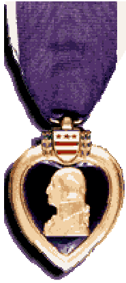
Purple Heart Medal