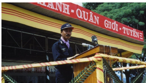
Premier (Gen.) Ky Addresses Guests