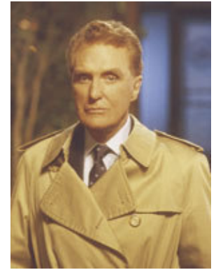
Actors Robert Mitchum and Robert Stack