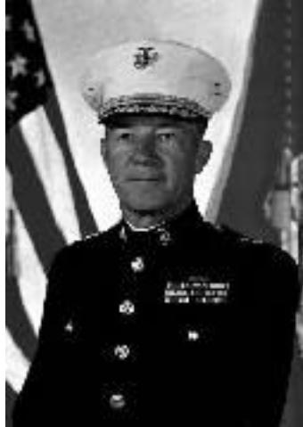
Major General Bruno A. Hochmuth 1911 – 1967