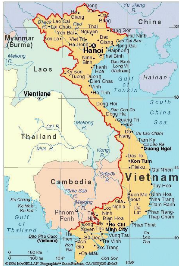
National Archives Map

THIRD MARINE DIVISION: HUE - PHUBAI: For the years 1966-1967 the Third Marine Division's forward headquarters was located in Phu Bai, about five miles south of Hue ("Way"), in the northern area of I Corps ("Eye Corps"), and was considered "Marine Country" since there were very few Army units assigned to I Corps during this period. At the very Northern end of I Corps was the Demilitarized Zone (DMZ), and North Vietnam was just on the other side of what was called both the demarcation line and the DMZ, which divided North and South Vietnam.