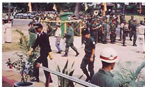
(L.) Premier (Gen.) Ky arrives; (R.) 1 st ARVN band