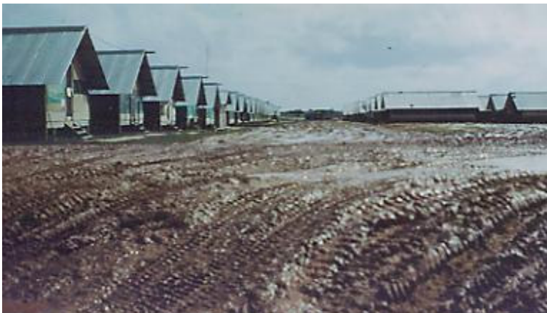
Command Post Area, 3 rd MarDiv, Phu Bai

PHUBAI: I especially remember the heavy, sticky mud in PhuBai that made it very difficult not only for vehicles, but also for walking. Vietnam is typically tropical with two main seasons: hot and dry, and hot and wet. The wet season generally begins in mid-April and lasts until mid-October. The rain begins in September and lasts through January.