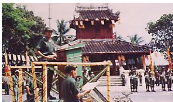
At dais: BGen. Ngo Quang Truong, CG 1st ARVN Division