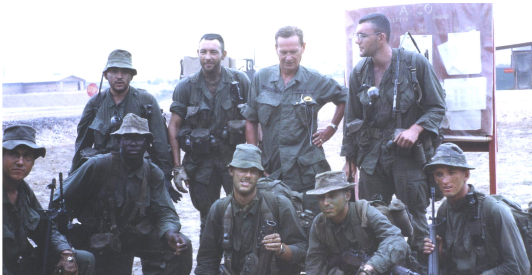
Members of 3 rd Marine Division Recon Patrol pose with TV Actor Wendell Corey

I clearly remember my thoughts at that moment as if it happened yesterday: “ He’s got to be kidding, certainly the General will laugh at this request. ” But Corey wasn’t kidding and the General didn’t laugh, but suggested that I “ see what (I) can do to get him (Corey) ‘out in the bush’ with a patrol. ” 9 At that point I knew what Corey was thinking, “Oh Boy, Great!” That’s not what I was thinking! Regardless, I knew that the General did not literally mean for us to actually “go out in the bush” putting ourselves “in harms way” and maybe even getting us both killed, but rather was assuming (if not praying ) that this old Second Lieutenant understood what he meant, and had enough common sense not to, even if I could or wanted to! After “inquiring” around the Division Staff (it’s amazing the cooperation you get when you work for a General), I learned that a recon patrol was due to return from a mission, and escorted Corey to the area where those Marines would be “de-briefed.”