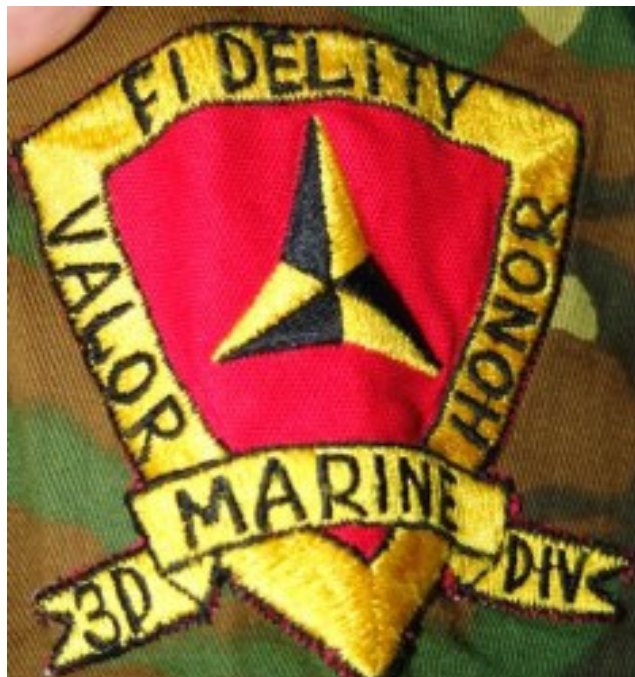
Third Marine Division Patch that was on a 3rd Marine Division “Tour Jacket.”

PREFACE: In May 1966 while stationed at Headquarters, U. S. Marine Corps (then at the Navy Annex in Arlington, VA, now in the Pentagon), I was commissioned a (Mustang) Second Lieutenant in the U. S. Marine Corps. At that time I was 36 years old, had 19 years of enlisted service and was a year away from a 20-year retirement in the grade I ultimately attained of Master Gunnery Sergeant E-9. Without the benefit of an Officer Candidate Course or any formal Officer training (other than required correspondence courses after commissioning), within several months of being commissioned I began a 13-month tour with the 3 rd Marine Division in Vietnam. No doubt my previous enlisted service and experience were a major factor in my being assigned as the Assistant Division Adjutant and Awards Officer, a position normally filled by someone of higher rank. During this tour I was also promoted to First Lieutenant. 1