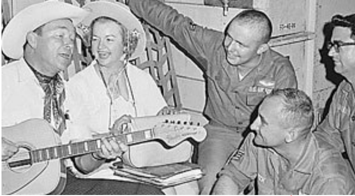
Western Stars Roy Rogers and Dale Evans 6