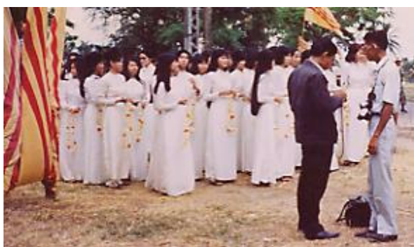
Ladies wait to place Lei's on Medal Awardees