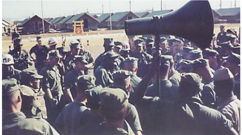
Former World Heavyweight Champion Floyd Patterson (center both photos) visits with the men of the 3 rd Marine Division, Phu Bai, Vietnam, July 1967

While the troops favored Floyd Patterson, my favorite was Roy Rogers and Dale Evans, and Wendell Corey was General Hochmuth's . Perhaps this was also because Corey was another Texan, and he and Gen. Hochmuth were about the same age and size. (Remember, too, we were both considerably “older” than the troops).