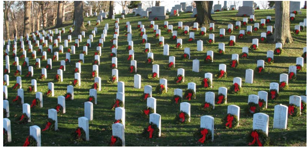
Memorial Section I, Arlington National Cemetery