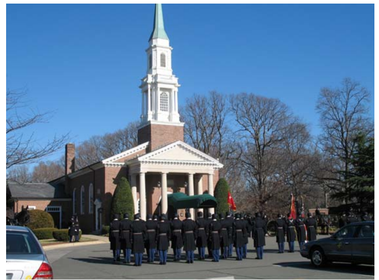
Old Post Chapel, Fort Myer, Virginia