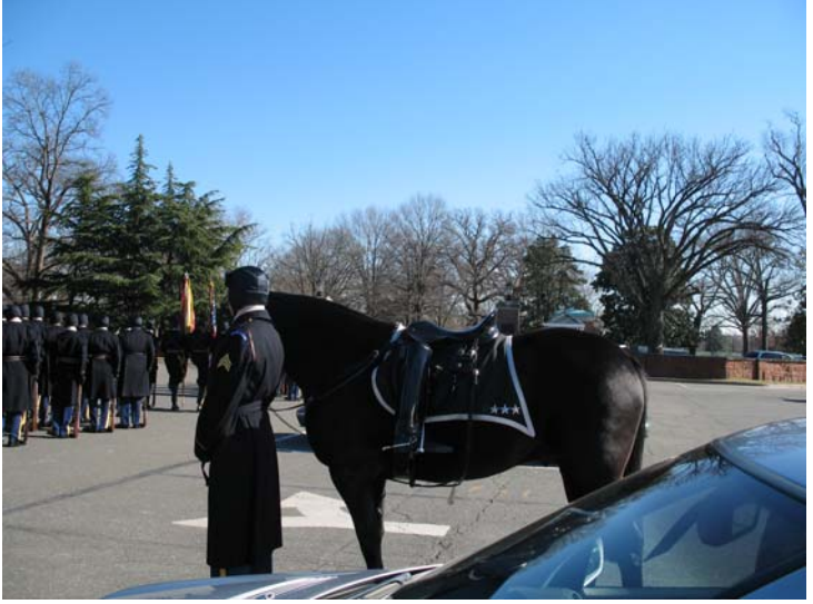
Riderless Horse with 3 stars of a Lieutenant General