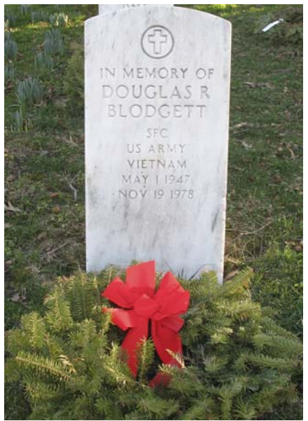
Brother of a former Virginia Neighbor

*Established by an Act of Congress and under regulations prescribed by the Secretary of the Army whereby appropriate memorials or markers may be erected in Arlington National Cemetery to honor the memory of certain individuals or group of individuals. This includes those who are missing in action; whose remains have not been recovered or identified; whose remains were buried at sea, whether by the member's or veteran's own choice or otherwise; whose remains were donated to science; or whose remains were cremated and their ashes were scattered without interment of any portion of the ashes. Such Headstone inscriptions begin with, "In Memory Of."