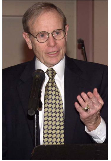
Lt. General Skibbie Remarks