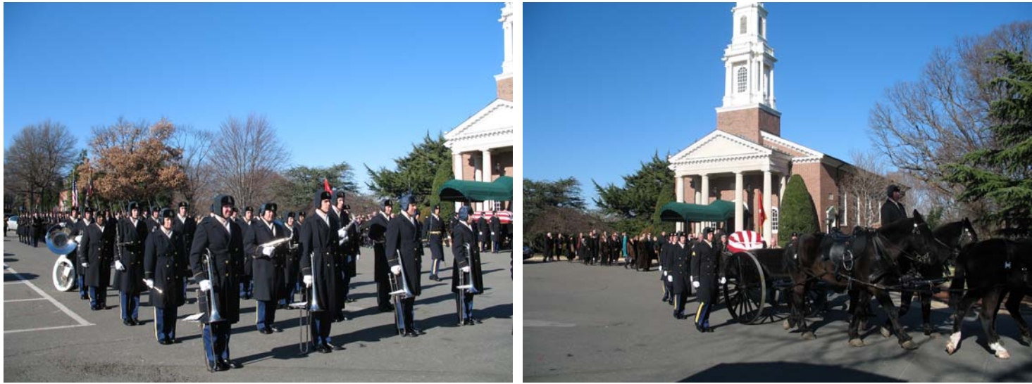
U.S. Army Band leads Caisson, Honor Guard Platoon and Family and Friends Entering Cemetery