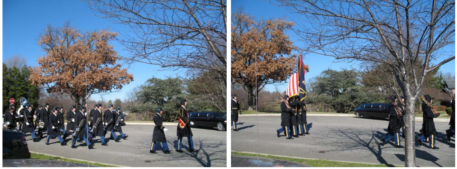
Army Honor Escort Forms in front of Old Chapel U.S. Army Color Guard follows Honor Guard