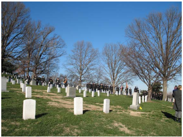
U.S. Army Band and Honor Guard on hill at gravesite