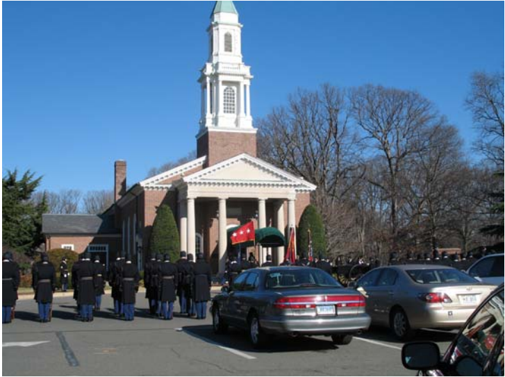
Military Escort and 3-star Flag at Old Post Chapel