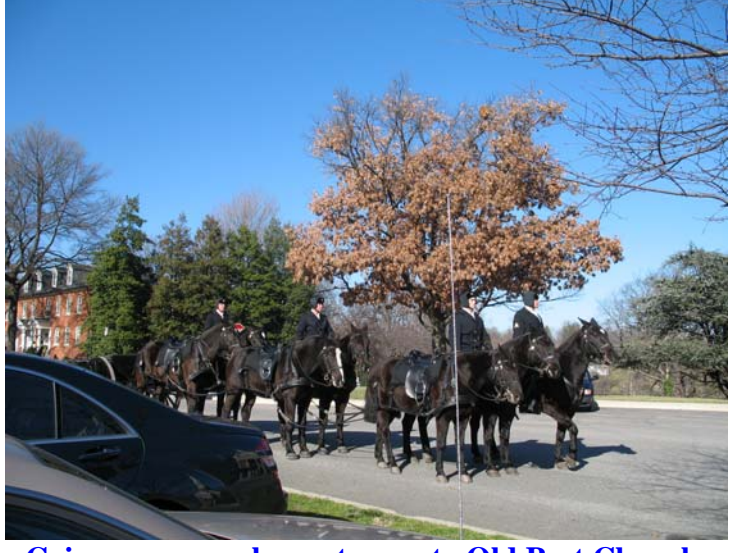
Caisson approaches entrance to Old Post Chapel