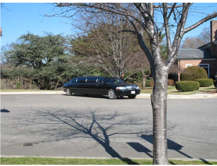
Hearse bringing Gen. Skibbie's remains to Chapel