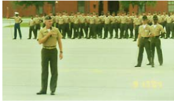
An LtCol. explains to families and guests the formidable training completed by the new Marines