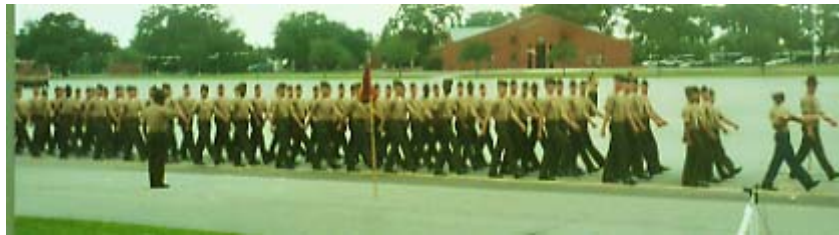
Platoons 2080, 2081, 2082, 2084, 2085, 2086, all Male Marines

The band began with a stirring musical medley by the Depot Marching Band, followed by the eight platoons and the Color Guard marching across the parade field and all passing in front of the reviewing stand and their families and friends seated in the bleachers as well. Following the six male platoons passing in review came the Depot Color Guard, and then the two platoons of Women Marines finished the March. (The Marine Corps is still the only military service training their recruits separately by gender).