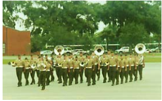
Eight Graduating Platoons of Marines muster at end of parade field as the Depot Band assembles

When the command was given eight massed platoons of fit, disciplined and smart Marines marched in platoon formation in front of the reviewing stand and assembled guests seated in the bleachers.