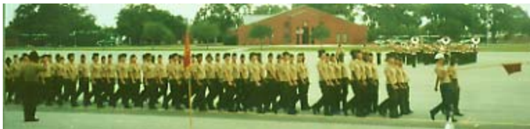
Platoons 4028 and 4029, all Women Marines