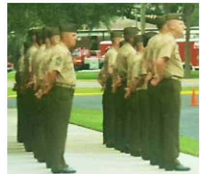
HqBn MCRD Staff