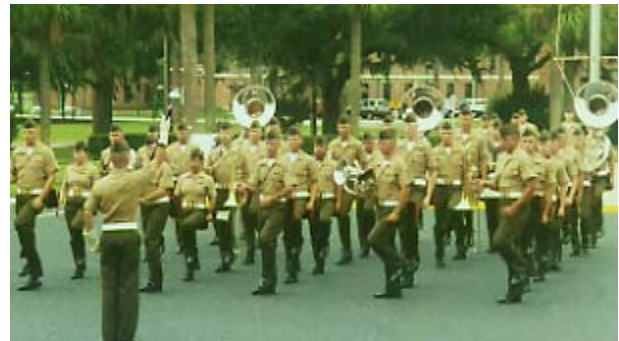
Color Guard and Marine Marching Band, Marine Corps Recruit Depot, Parris Island, S. C. at Morning Colors, 17 September 2004