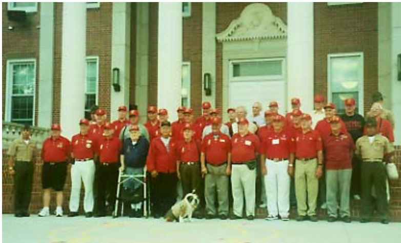
E-2-5 (Korea) Association at 16Sep04 Reunion, MCRD PI SC