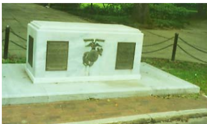
L: Savannah Vietnam Veterans Memorial, built in 1991, is a marble replica of Vietnam placed inside a reflecting pool. The names of Chatham County soldiers killed during the war are included in the memorial. R: Marine Corps Memorial dedicated by Marine Corps Commandant Gen A.A. Vandegrift

The overwhelming highlight of our reunion was on September 17 th when E-2-5 Marines were guests at both Morning Colors and the Recruit Graduation Parade at the Marine Corps Recruit Depot at Parris Island, SC. It was at the end of the latter ceremony that I witnessed an extraordinary display of Marine Leadership that defies description; one unfortunately that only a handful of us were privileged to observe; thus my desire to share it with as many others as possible. A detailed explanation of this experience will follow.