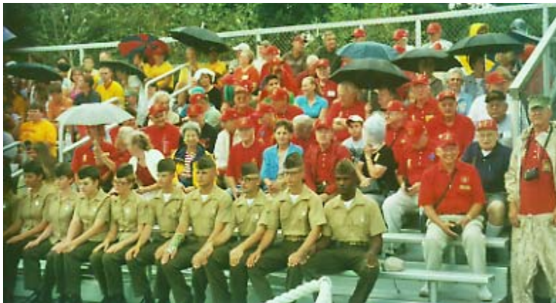
E-2-5 Marines in Reviewing Stand

But what a thrill it was witnessing these 500 new Marines earning that title and their Eagle, Globe and Anchor at the same time. I would estimate there were between one and two thousand visitors in attendance the day of our visit, consisting of family members and friends of the over 500 graduating recruits. Various introductions were made to the assembled guests, each accompanied by substantial applause.