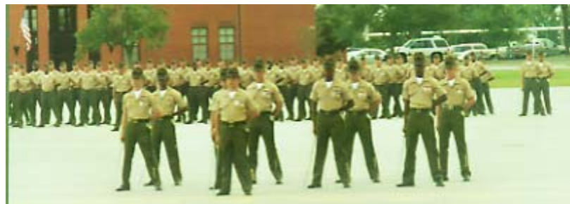
Drill Instructors of 8 Graduating Platoons

Drill Instructors (DI's) from each of the eight platoons also assembled and assumed their positions in front of their platoons, preparing to play their last role for the men and women they lived with, toiled for, instructed, counseled and cajoled until they had molded them into United States Marines.