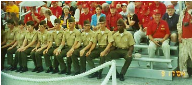
Nine Marine Privates in reviewing stands (Writer is seated to right of lady in the blue jacket)

As luck would have it, I was seated in the second row from the bottom, closest to the official reviewing area. Upon sitting down I could not help but notice there were nine Marine privates, four female and five male, seated in the first row immediately in front of me. Simultaneously I noticed that immediately behind them, a half step below my feet, were neatly stacked rows of crutches. I thought that strange but did not dwell on it.