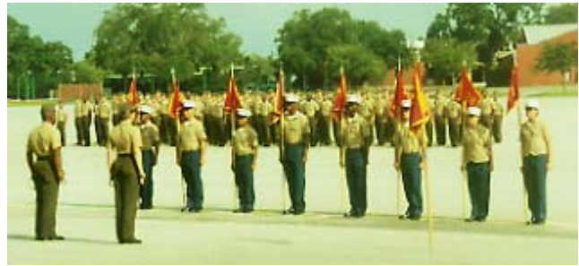
DI's and Honor Graduates come "front and center" for recognition

Just prior to passing in review the Honor Graduates were also called "front and center" to be recognized and presented with plaques by both their own DI and the Lieutenant Colonel in charge of training at Parris Island. Each of the Honor Graduates was also wearing their new Private First Class (PFC) chevrons earned as part of their honors. (Noting this, it reminded me that to this day I never understood why my junior DI was "only" a Private, the same rank as his recruits)?