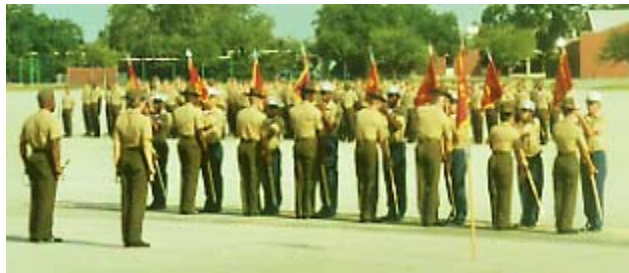
Eight "Honor Graduates" of (male) Platoons 2080, 2081, 2082, 2084, 2085, 2086 and (female) Platoons 4028 and 4029 receive plaques from their respective Drill Instructors

The excitement was building and I doubt there was anyone in attendance who could not help but both feel and share the presence of excitement as well as the same pride the recruits were experiencing as they reacted to the cheers of the assembled guests.