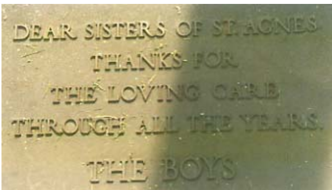
Plaque for Sisters of St. Agnes