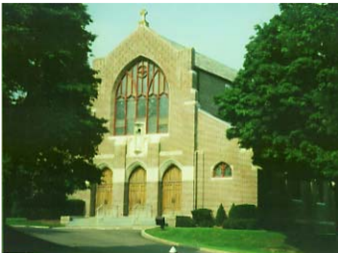
Holy Rosary Chapel, St. Agnes, Sparkill, NY