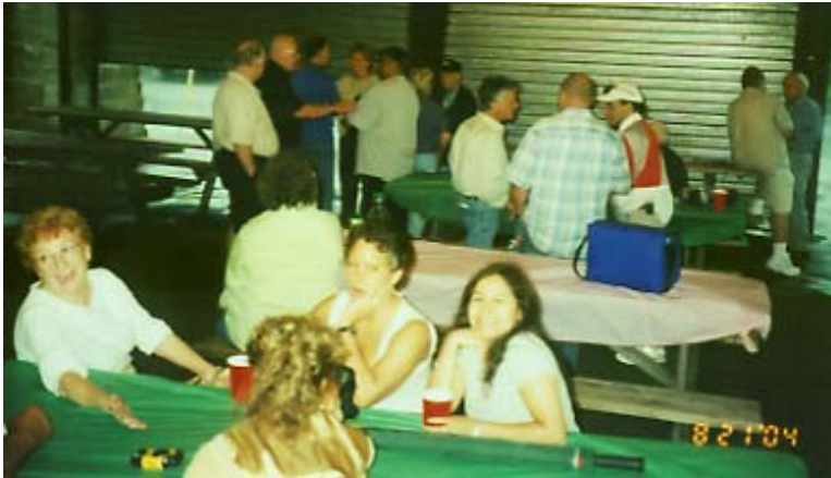
During the rain storm: Ladies on the left, men on the right (Drinkers in the middle)