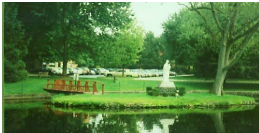
St. Agnes Lake and Blessed Mother Statue