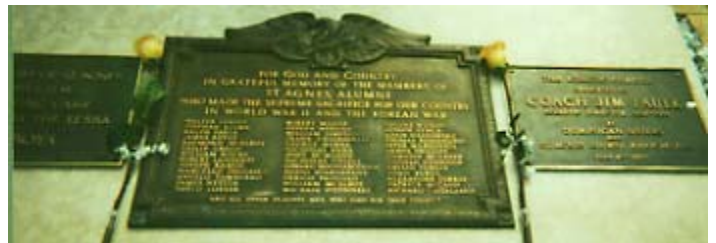
Plaques dedicated by St. Agnes Alumni