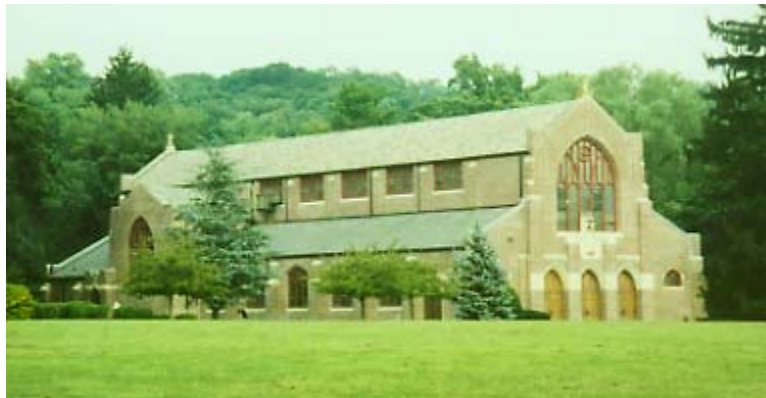
Holy Rosary Chapel, St. Agnes, Sparkill, NY