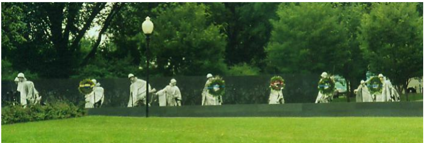
Approaching Patrol, Korean War Memorial, Washington, D. C., July 27, 2003