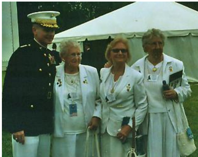
Gen. Pace with three Gold Star Mothers