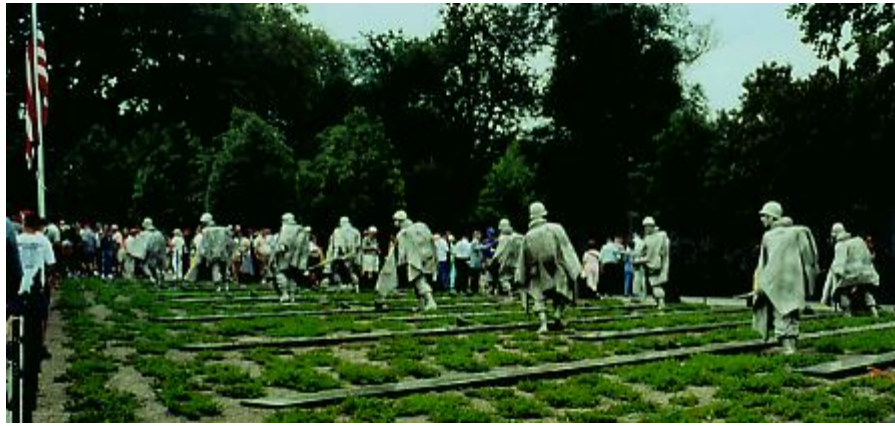
Top & Below: Patrol, facing front and rear, Korean War Memorial