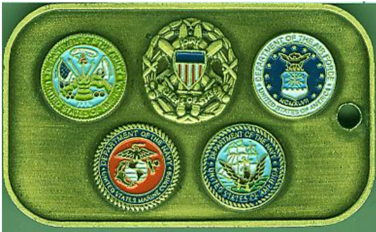
Reverse side of Gen. Pace's Challenge Coin