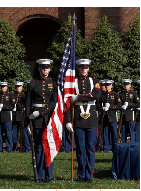
U.S. Marine Corps Color Guard