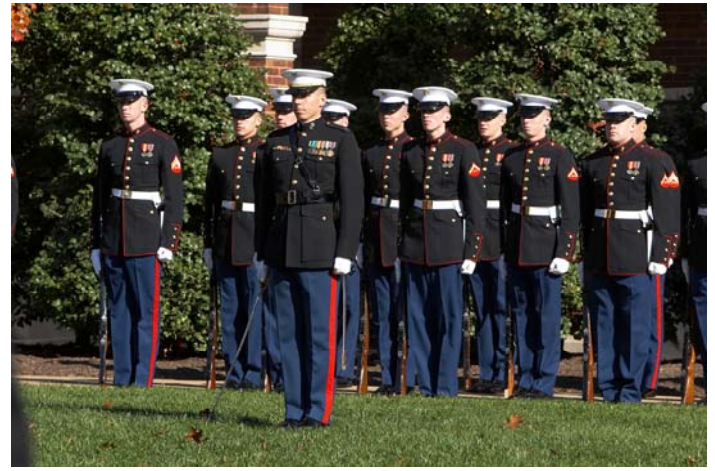
U.S. MARINE CORPS CEREMONIAL MARCHING UNIT, MARINE BARRACKS, WASH., D.C.