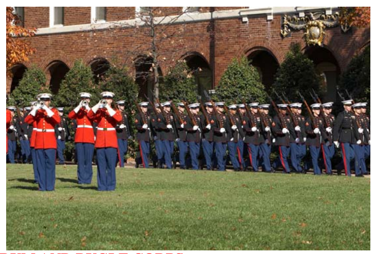
UNITED STATES MARINE DRUM AND BUGLE CORPS