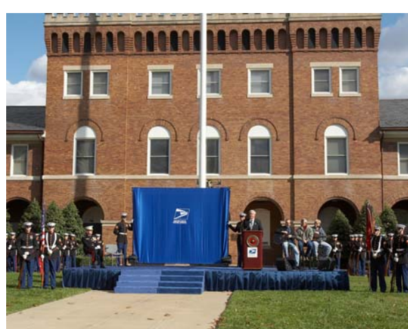
UNVEILING CEREMONY OF DISTINGUISHED MARINE STAMPS