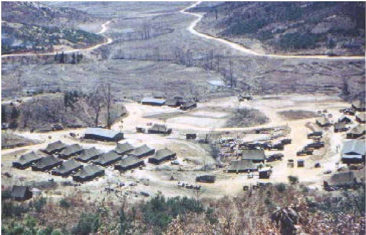
Army Engineers Command Post on reverse slope of Kansas Line