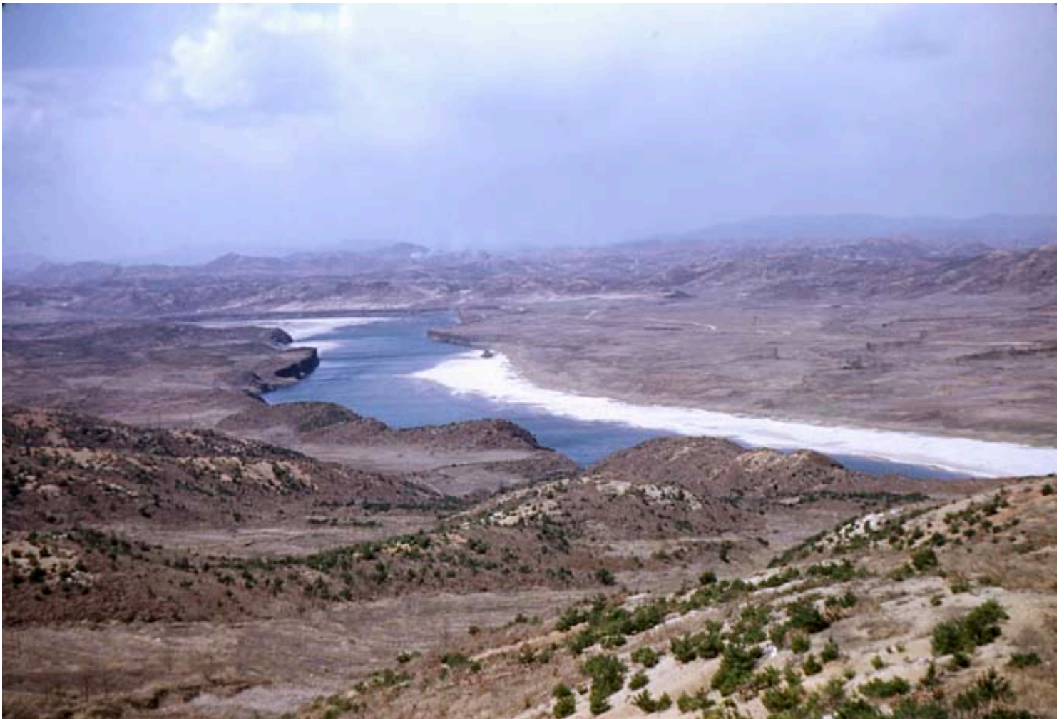
IMJIM RIVER VIEWED FROM THE KANSAS LINE. AFTER THE OUTPOST WARS OF VEGAS, CARSON AND RENO