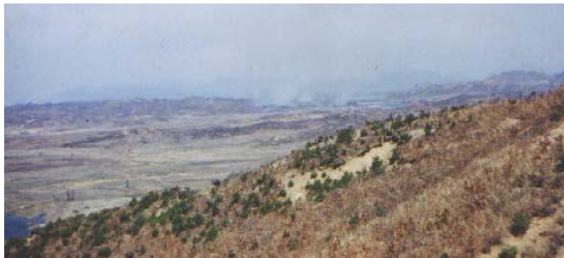
Artillery Fire (center) in front of the Kansas Line