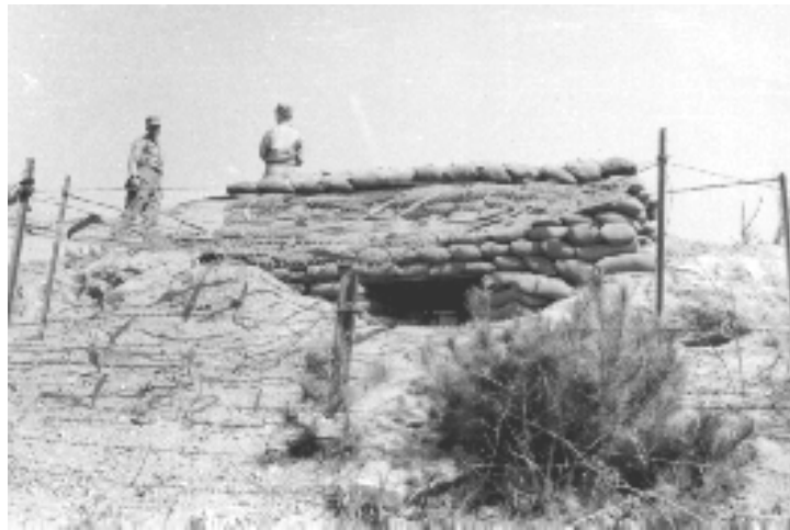
Bunkers strewn with barbed wire on Kansas Line