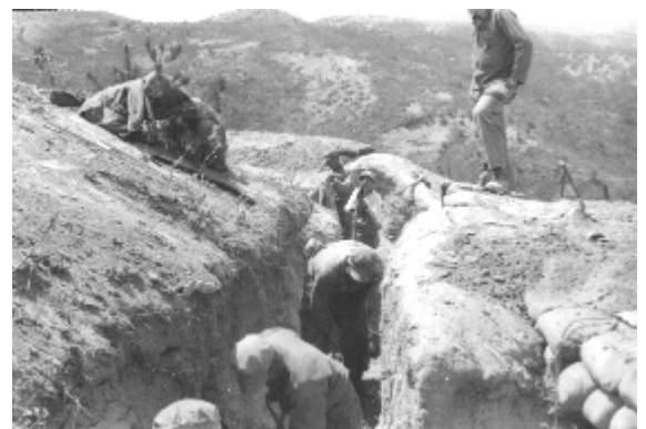
KSC's Digging Trenches on Kansas Line