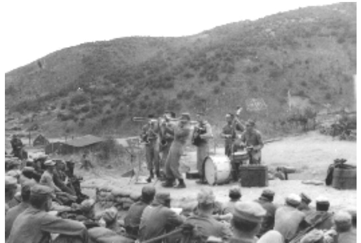
Jazz Unit from 1 st Marine Division Band Visits E-2-5