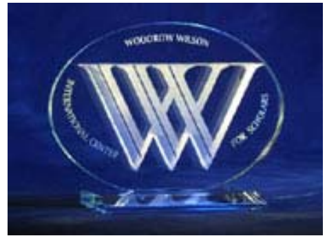
Woodrow Wilson Award