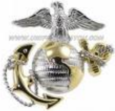
U. S. Marine Corps