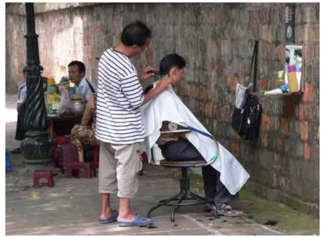
(L.): Vietnamese Barber Shops of recent vintage in Hue and (R.) Ho Chi Minh City (formerly Saigon)