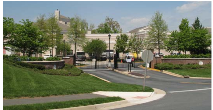
Falcon's Landing, Potomac Falls, Virginia

When I asked the son if his Dad was a retired military officer he said no, but that he was " retired from the government. " I told him that my wife and I considered Falcon's Landing before we bought our present home over 15 years ago, but decided that after my career in the Marine Corps I didn't want to live on any more military-related "Posts." When I laughingly added that another reason was because I didn't want to have to " salute General's and Admiral's every day, " that brought chuckles all around, including from My.