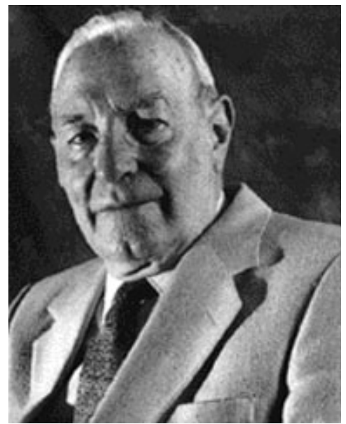
Harlan Cleveland (with Son's crafted cane) as Keynote Speaker, 2006 Cold War Symposium; World Academy Fellow, Ph.D.

Now I know there will be a few of my fellow Marines asking, " But was he a Marine? " Well while this would really be additional icing on the cake, and I wish Mr. Cleveland's already absolutely fabulous résumé included that honor, it did not. But then again, I was never an Ambassador, a Fellow, a PhD, or a Medal of Freedom recipient for that matter! 'Nuff said about this very distinguished elderly gentleman!