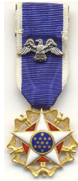
U.S. Medal of Freedom