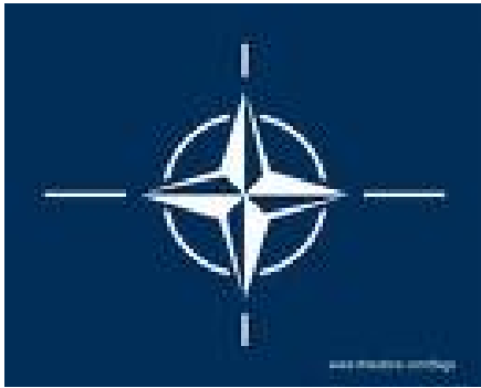
North Atlantic Treaty Organization

Award, and the U. S. Medal of Freedom! 8 He has so many other achievements and record of service to our country that I could fill a book listing those alone. WOW!!