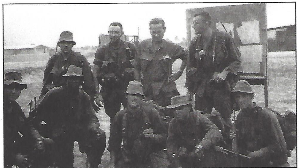
Phu Bai, Vietnam: August 1967: Actor Wendell Corey with members of Third Marine Division Reconnaissance Patrol.