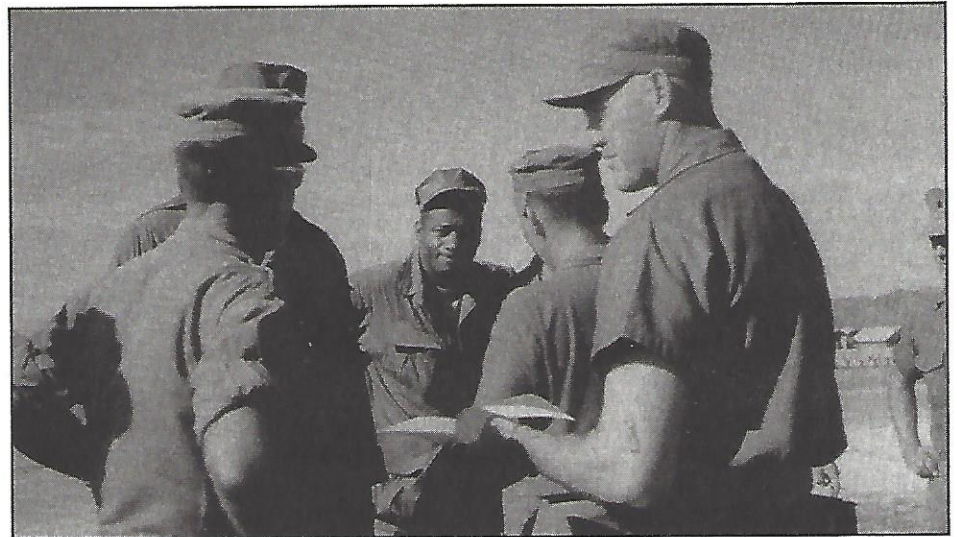
July 1967: Center: Floyd Patterson, World Heavyweight Champion 1956-1959 and 1960-1962, visits the 3rd Marine Division.