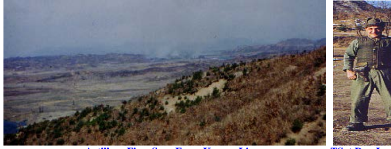
Artillery Fire: Seen From Kansas Line