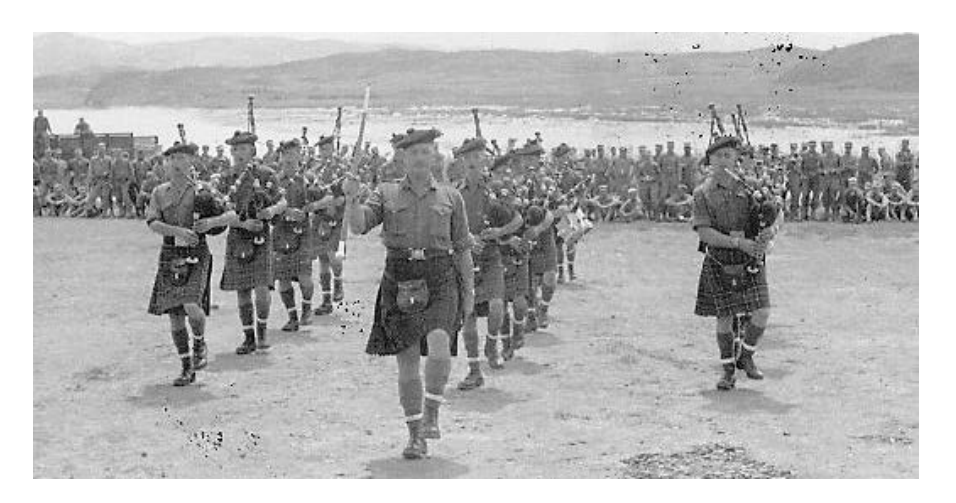
JULY 1952: Scottish Black Watch (UK) Leader and Unit entertaining 1stBn5th Marines-Chajipo, Korea