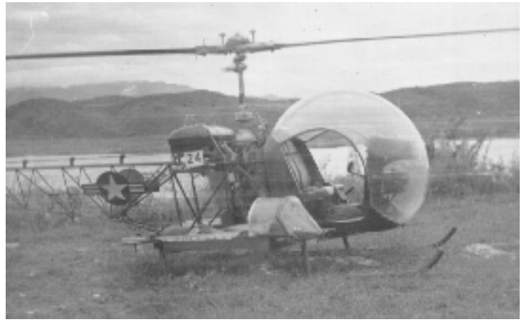
TSgt Merna on Emergency Evacuation Helicopter , 1952

<sup>th</sup> Replacement Draft 1<sup>st</sup> five days training after arrival