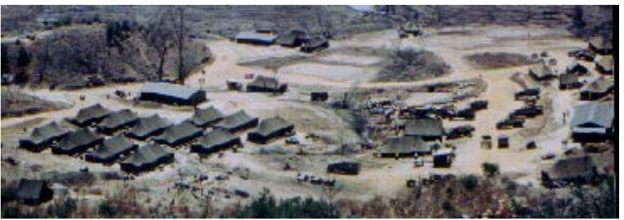
Army Engineer Command Post on our Reverse Slope