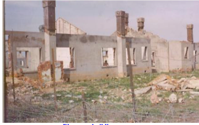
Blown up building