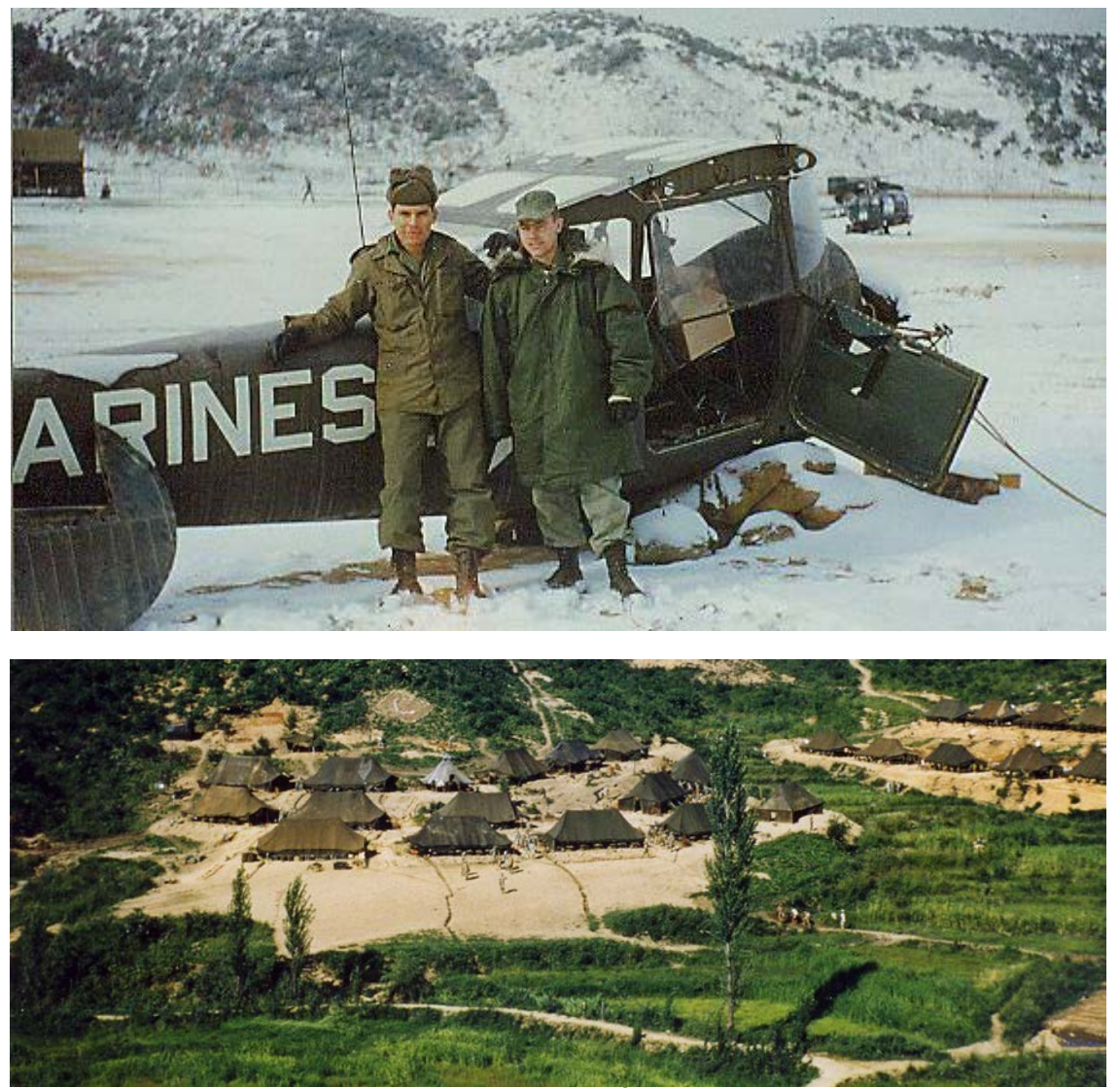
AUGUST 1952: Command Post, 1<sup>st</sup> Battalion, 5<sup>th</sup> Marines, 1<sup>st</sup> Marine Division, Korea